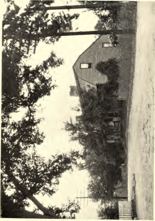
MILES GARRISON HOUSE, SWANSEA, MASSACHUSETTS